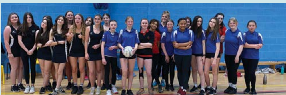
Fowey and Sir James Smith Schools