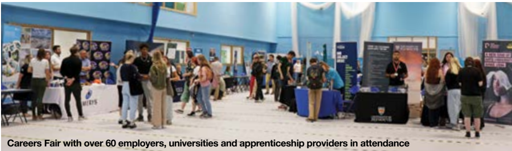
Careers Fair with over 60 employers, universities and apprenticeship providers in attendance

During day one of Your Future Week - Careers Day, first year students had the opportunity to explore their post-18 academic and career options at our Careers Fair with over 60 employers, universities and apprenticeship providers in attendance including Exeter, Truro & Penwith, Plymouth Marjon and Falmouth universities, Cornwall Fire and Rescue Service, Software Cornwall, Cornwall Partnership NHS Foundation Trust, Spaceport Cornwall, Happy Days Nurseries & Pre-Schools, Pirate FM, Next Steps SW, The Focus Training Group and many more.